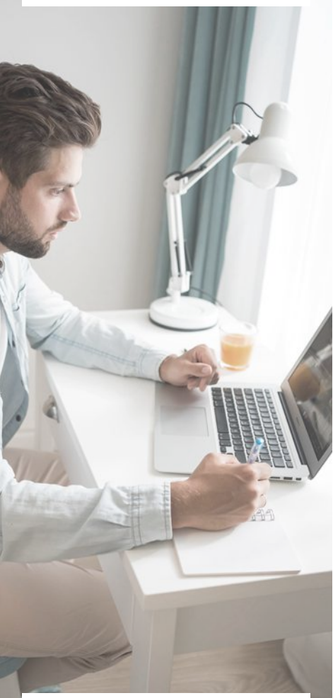
Table of Contents for Upwork Pitch Deck