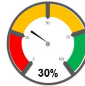
Tasks In Progress