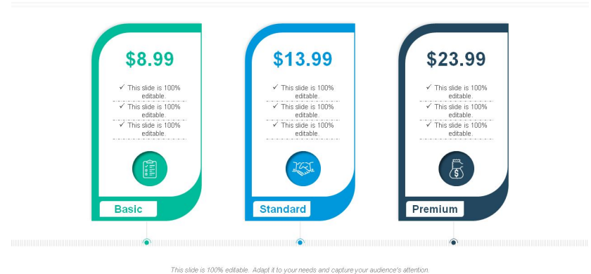
Price List Side for Different Subscription Plan