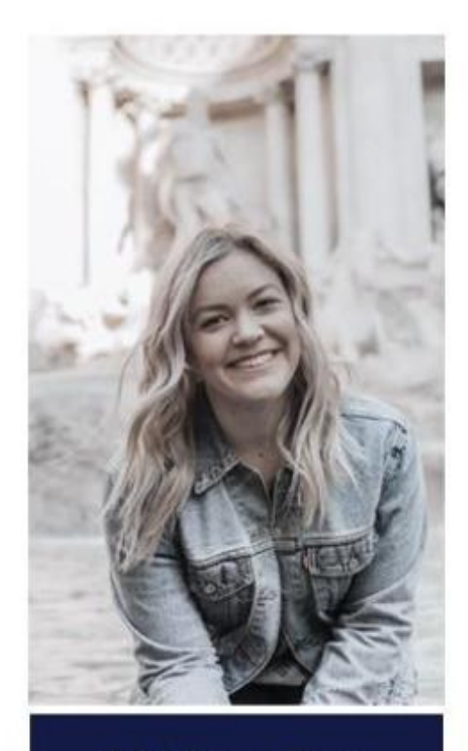
Add Name Here

This slide is 100% editable. Adapt it to your needs and capture your audience's attention.