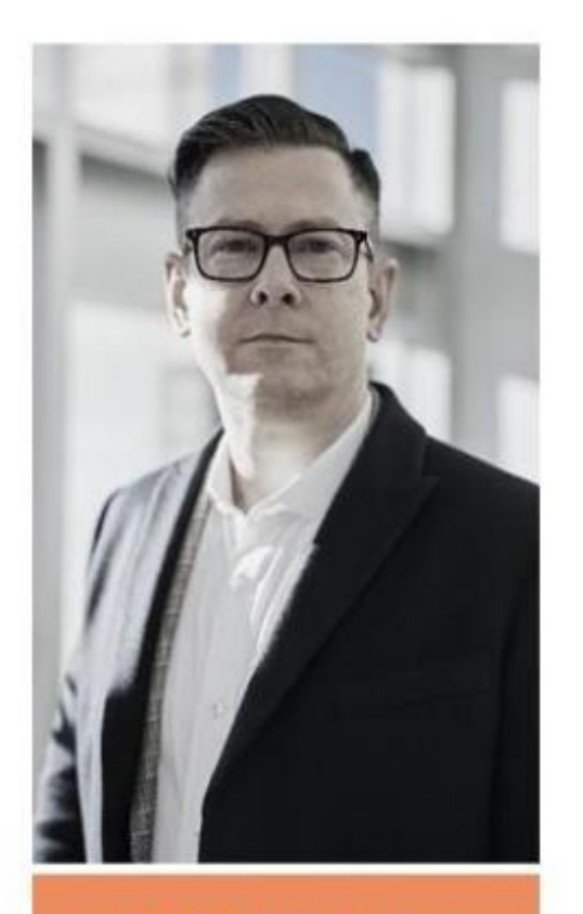
Add Name Here

This slide is 100% editable. Adapt it to your needs and capture your audience's attention.