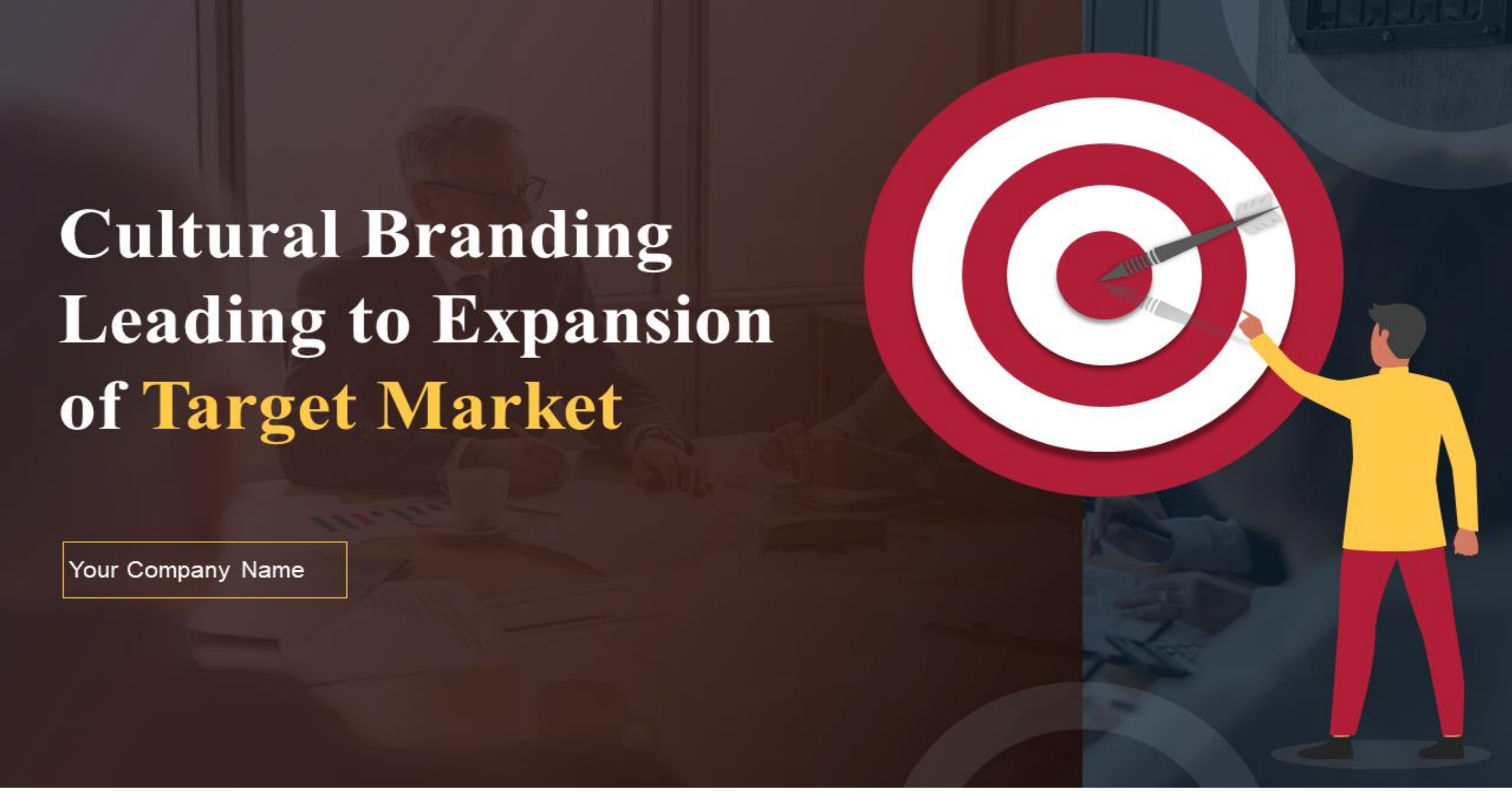
Click Here to get an Editable Version.